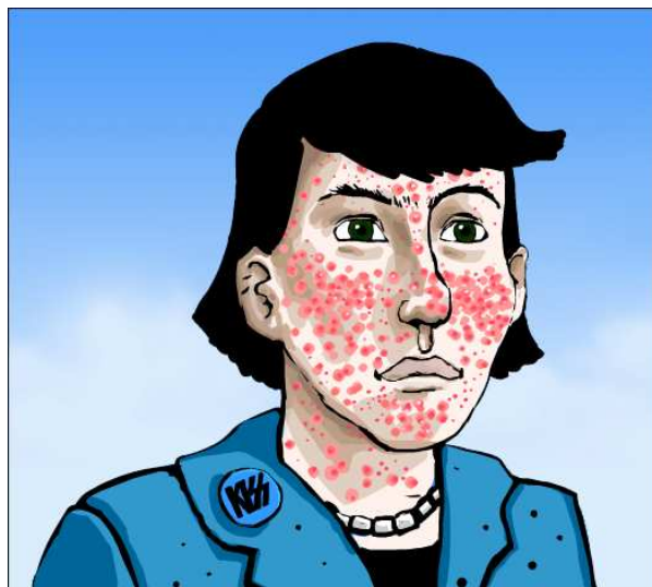
Image representing Acne vulgaris scattered on face and neck.