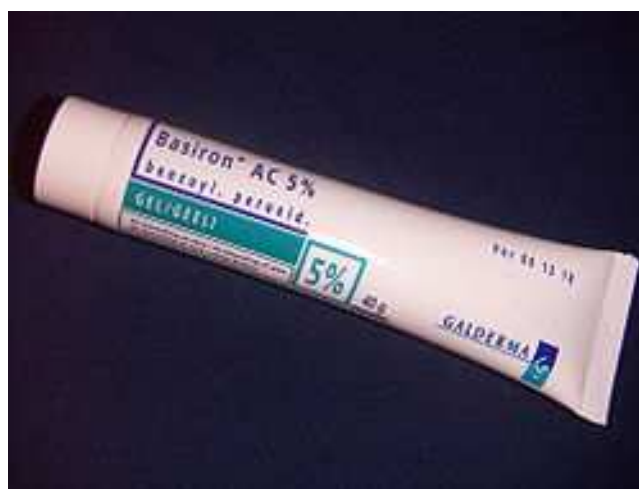
Soluble Benzoyl peroxide (Novel Drug)